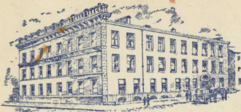
First Class Family and Commercial.