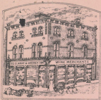
U.S. & Co. D.