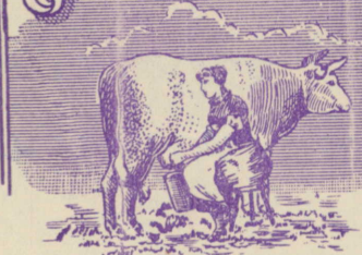
STEAM DAIRIES AT BALLYWILLIAM