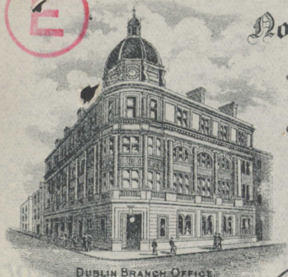
DUBLIN BRANCH OFFICE