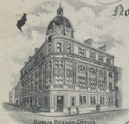
DUBLIN BRANCH OFFICE