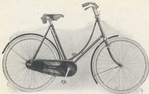
"OLYMPIA" LADY'S ROADSTER MODEL

Easy Payments: 15 Monthly Payments of 9/4.