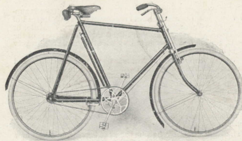
"OLYMPIA ROAD RACING MODEL "

Easy Payments: 15 Monthly Payments of 9/10.