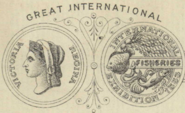
FISHERIES EXHIBITION 1883.

AWARDED THE ONLY SPECIAL PRIZE WITH GOLD MEDAL & DIPLOMA.