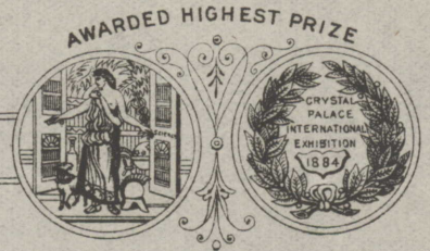
CRYSTAL PALACE 1884.

AWARDED THE ONLY SPECIAL PRIZE WITH GOLD MEDAL & DIPLOMA.