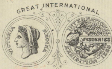
FISHERIES EXHIBITION 1883.

AWARDED THE ONLY SPECIAL PRIZE WITH GOLD MEDAL & DIPLOMA.