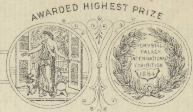
CRYSTAL PALACE 1884.

AWARDED THE ONLY SPECIAL PRIZE WITH GOLD MEDAL & DIPLOMA.