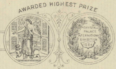
CRYSTAL PALACE 1884.

AWARDED THE ONLY SPECIAL PRIZE WITH GOLD MEDAL & DIPLOMA.