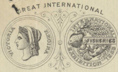
FISHERIES EXHIBITION 1883.

AWARDED THE ONLY SPECIAL PRIZE WITH GOLD MEDAL & DIPLOMA.