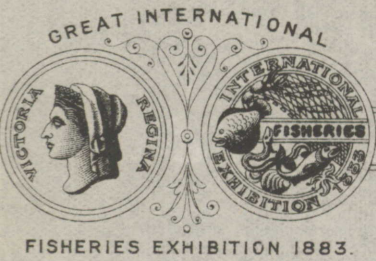
FISHERIES EXHIBITION 1883.

AWARDED THE ONLY SPECIAL PRIZE WITH GOLD MEDAL & DIPLOMA.